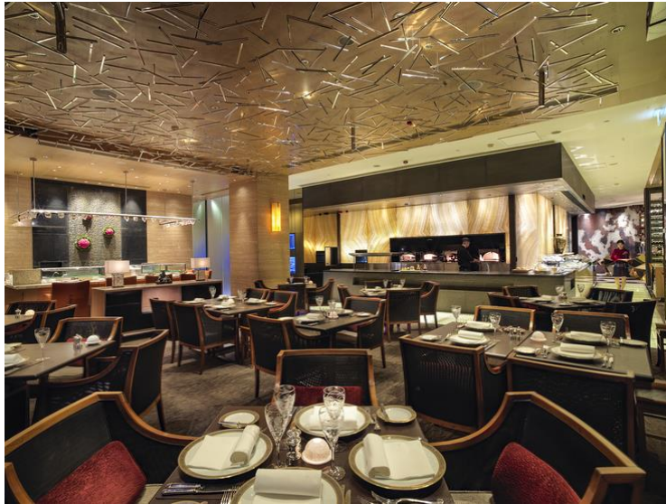
The Kitchen has earned 1 Diamond for six years in a row