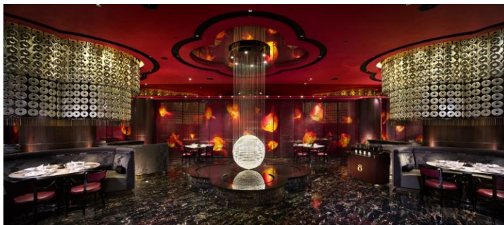
The 8 has earned 2 Diamonds for two consecutive years