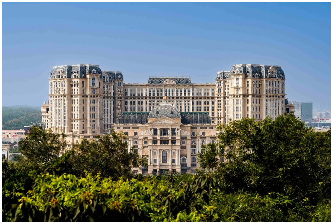
Grand Lisboa Palace Resort Macau is now the only integrated resort in the world where every hotel has earned the FTG Five-Star rating.