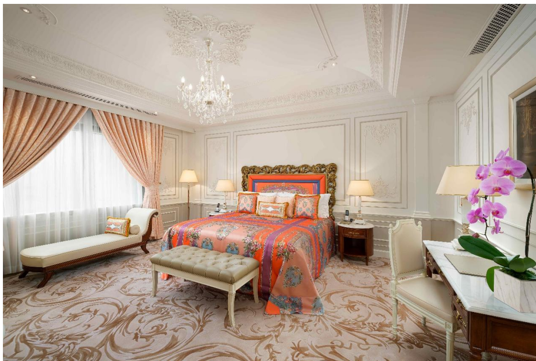
Palazzo Versace Macau has joined the elite ranks of FTG Five-Star hotels in the 2026 edition.