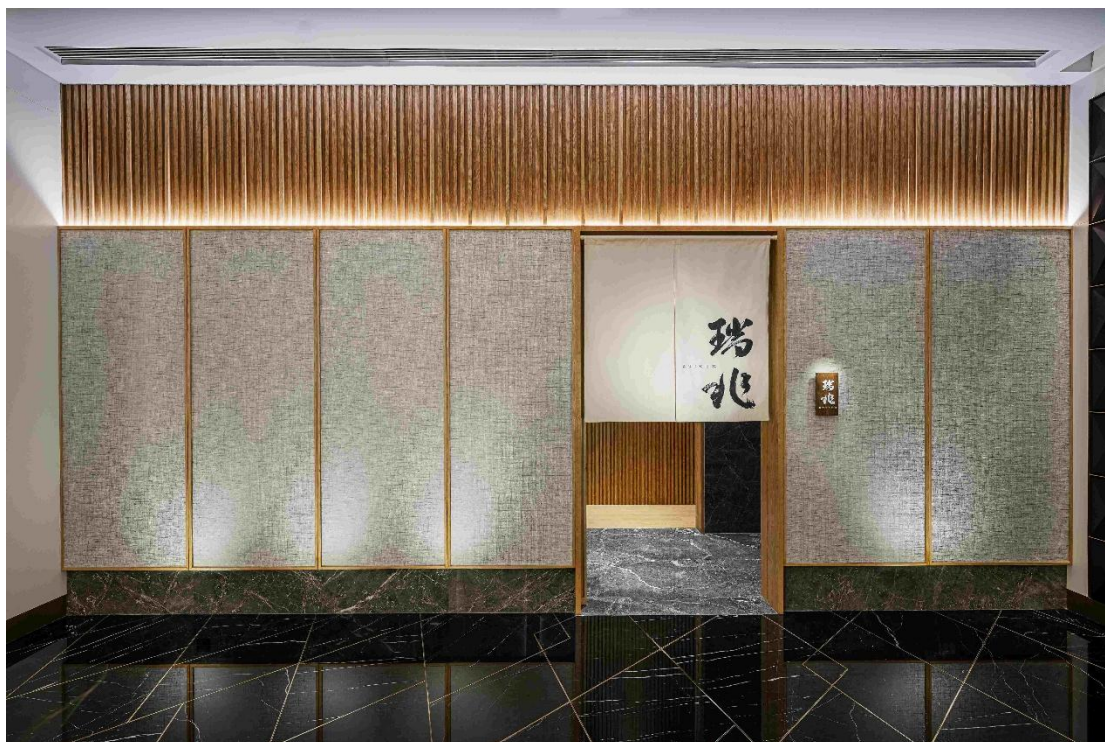
Zuicho celebrates its second consecutive year as a FTG Five-Star restaurant.