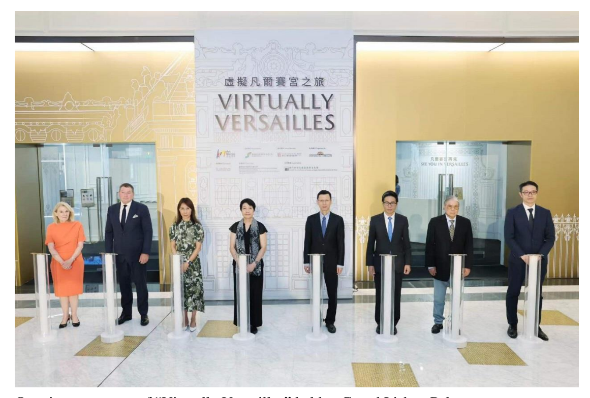
Opening ceremony of "Virtually Versailles" held at Grand Lisboa Palace.