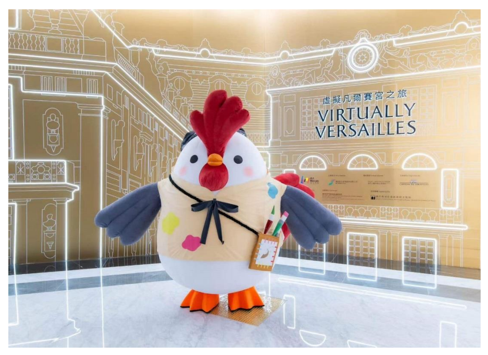
SJM mascot "Sam the Rooster" brightens up the opening ceremony with his colourful artist costume.