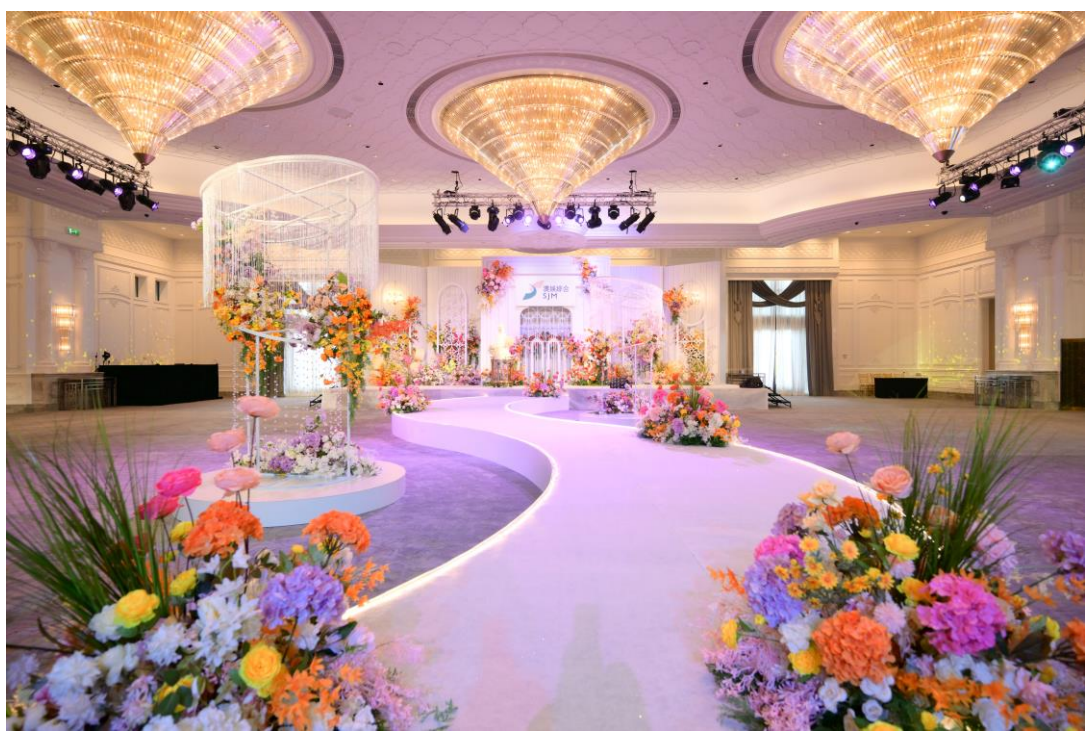
SJM hosts the "SJM Wedding Fair" themed under "Unforgettable love, timeless elegance".