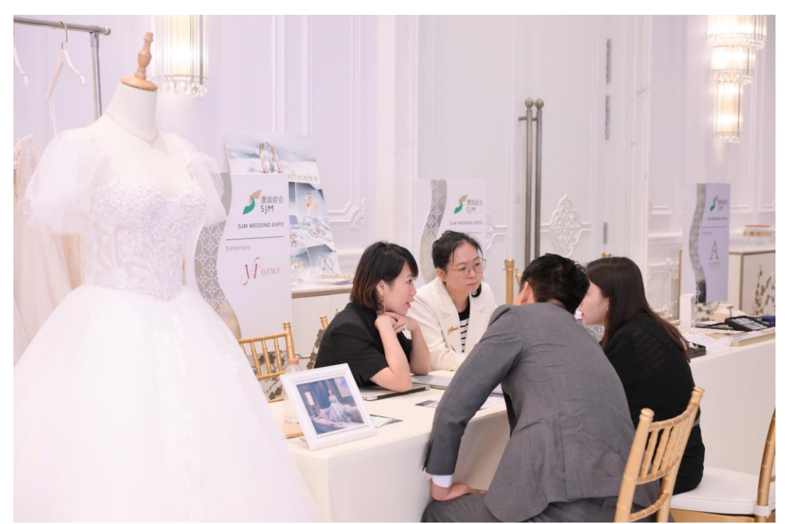
"SJM Wedding Fair" spotlights an array of wedding services from both Grand Lisboa Palace and Grand Lisboa Hotel, alongside offers from participating wedding companies from Hong Kong and Macau. Promotions on offer included wedding management, venue decoration, wedding attire, makeup and styling, floral arrangement, jewellery, videography and photography.