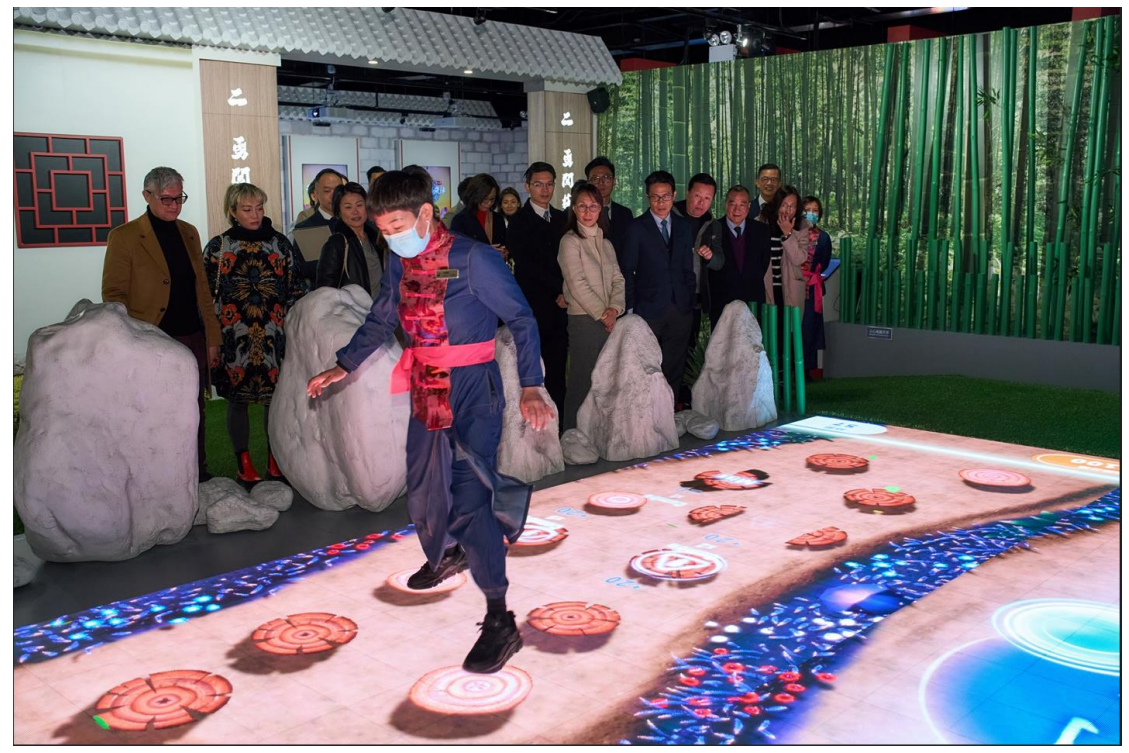
Guests tour the Martial Arts Arena themed experience zone at Grand Lisboa Palace.