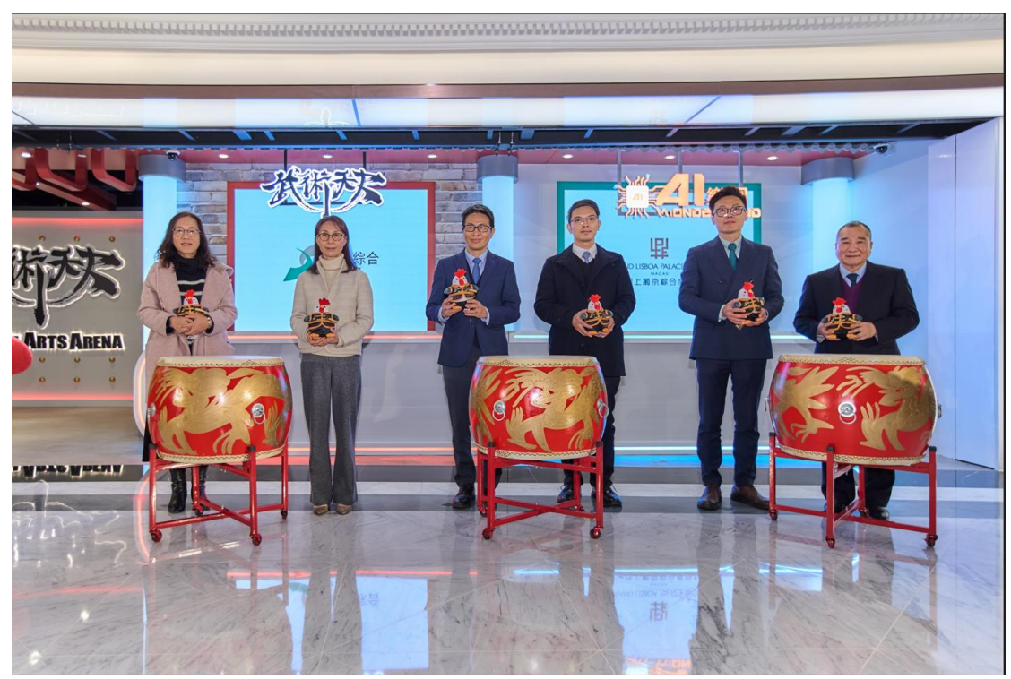
The SJM Martial Arts Arena and AI Wonderland themed experience zones at Grand Lisboa Palace are now officially open, and distinguished guests preside over the drumbeating ceremony.