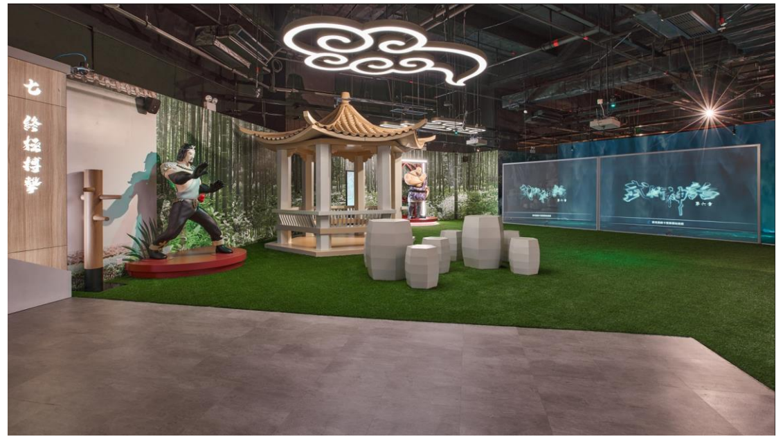
The Martial Arts Arena at Grand Lisboa Palace takes players through seven challenging levels to practice the art of Shaolin Kung Fu with world-class technology.