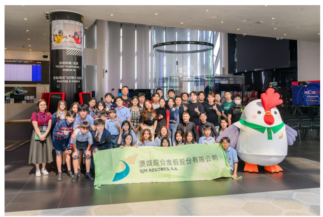
Students gather for a group photo at the GoAirborne Macau indoor skydiving (Macau) after attending a Youth Talk.