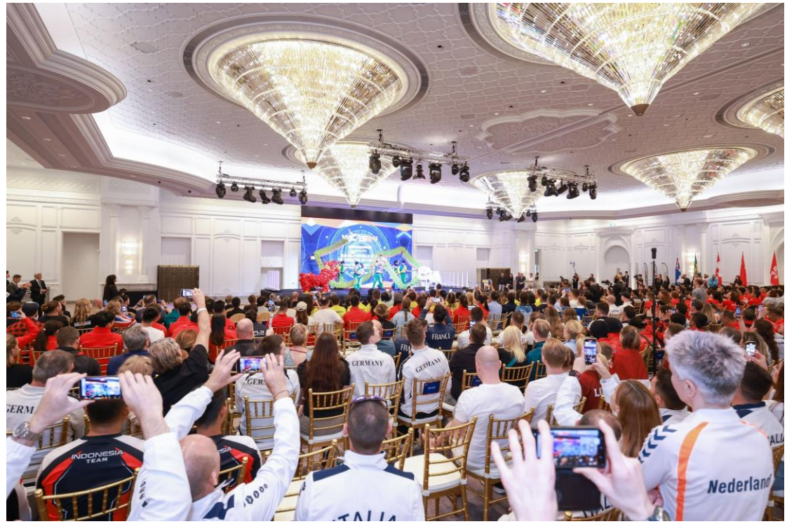
The opening ceremony of the 5th FAI World Cup of Indoor Skydiving is hosted at Grand Lisboa Palace today.