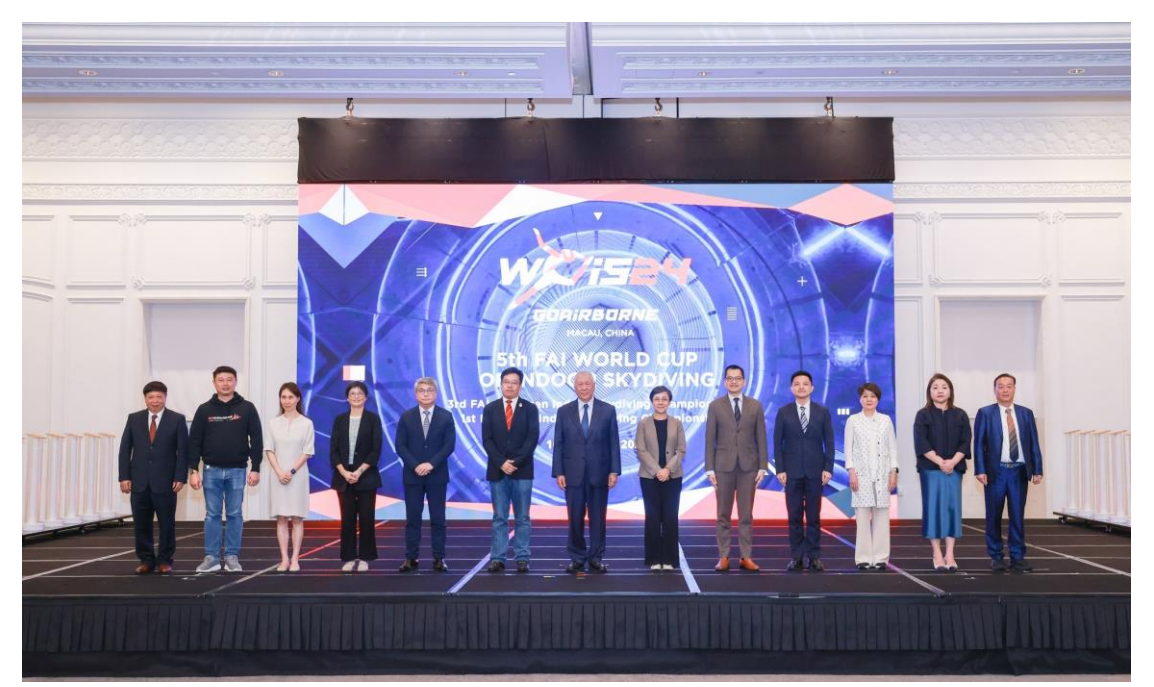
Distinguished guests attend the opening ceremony of the 5th FAI World Cup of Indoor Skydiving, platinum-sponsored by SJM.