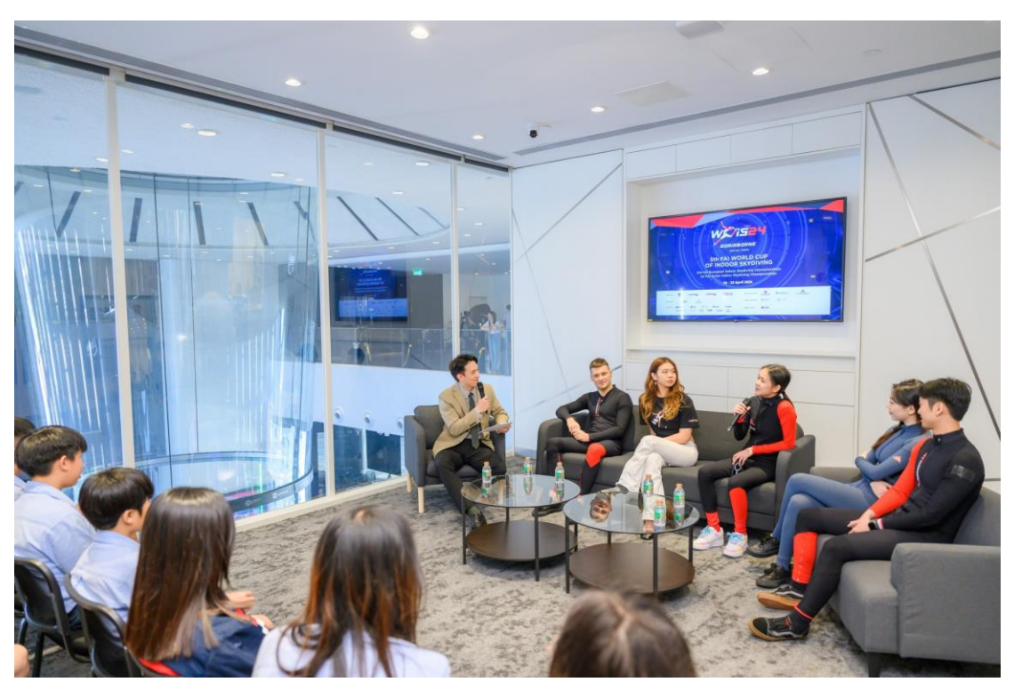
Indoor skydiving elite athletes share their training stories to encourage the younger generations to discover their strengths.