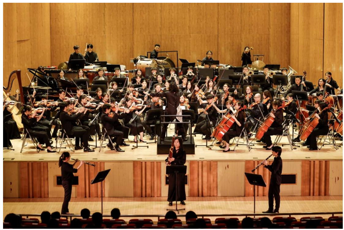
92 rigorously selected musicians from Guangdong, Hong Kong, and Macau showcase their talents, heralding a new era in the cultural and artistic evolution of the Bay Area.