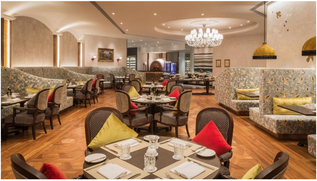
SJM Receives the Most "Grand Awards" in Asia from Wine Spectator again, which are awarded to Robuchon au Dôme and Casa Don Alfonso respectively.