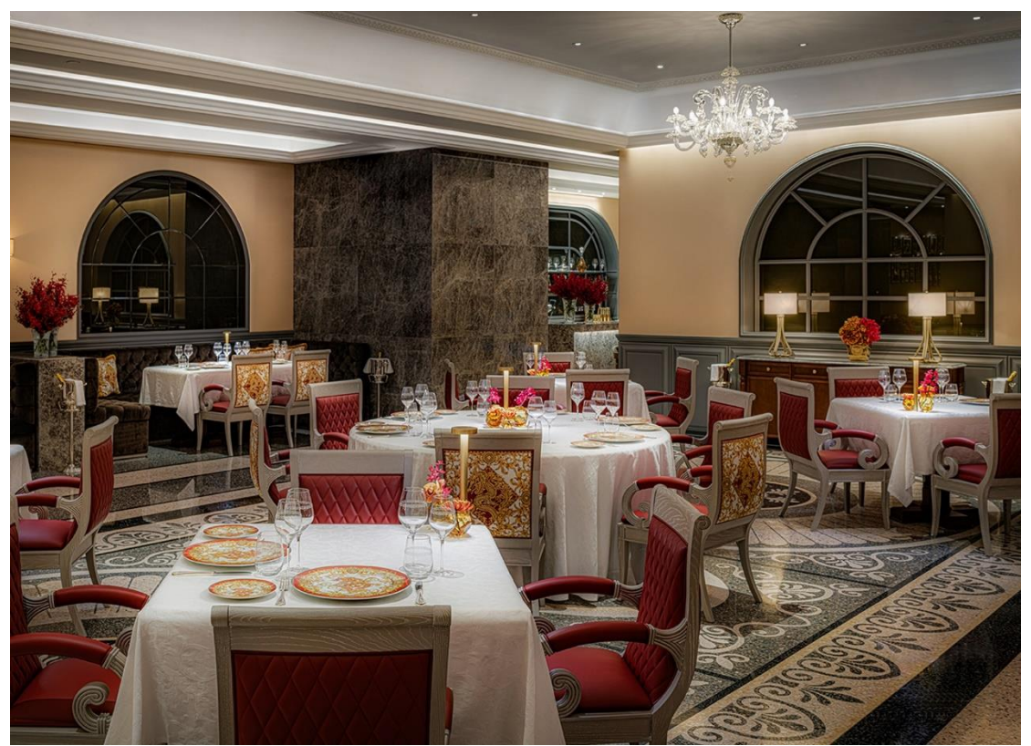
The 8 and Don Alfonso 1890 also make their debut on the Wine Spectator awards list this year by earning the "Best Award of Excellence."