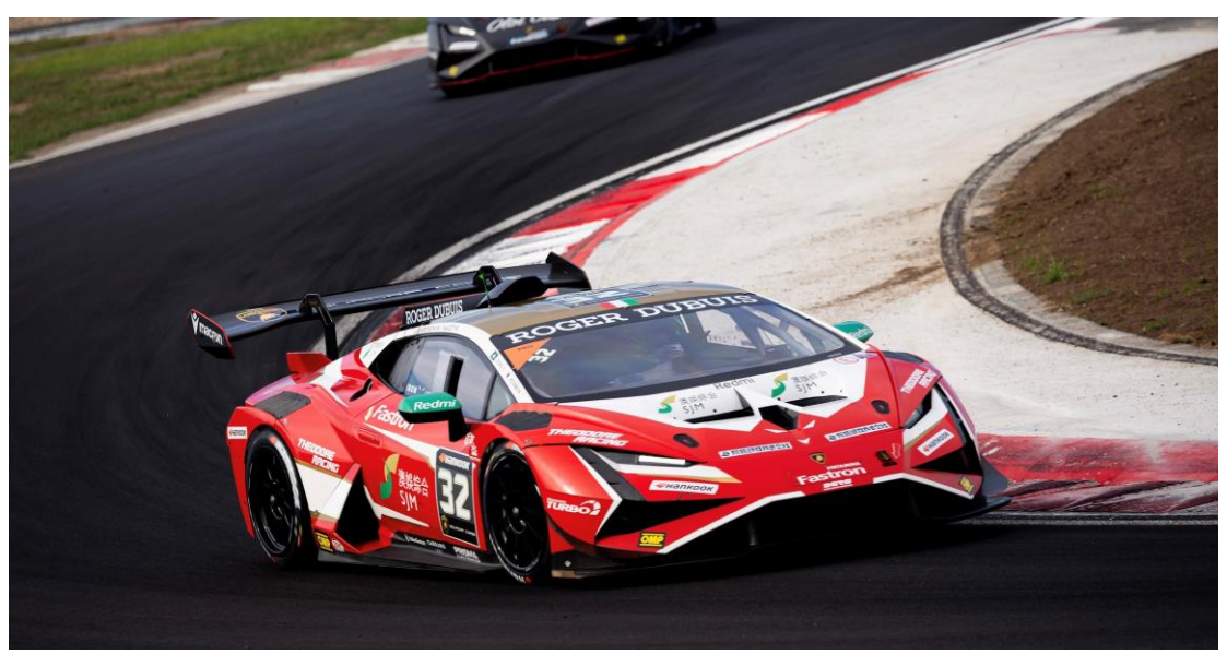
Charles Leong Hon Chio sets the fastest lap time in the final round of the Lamborghini Super Trofeo Asia.