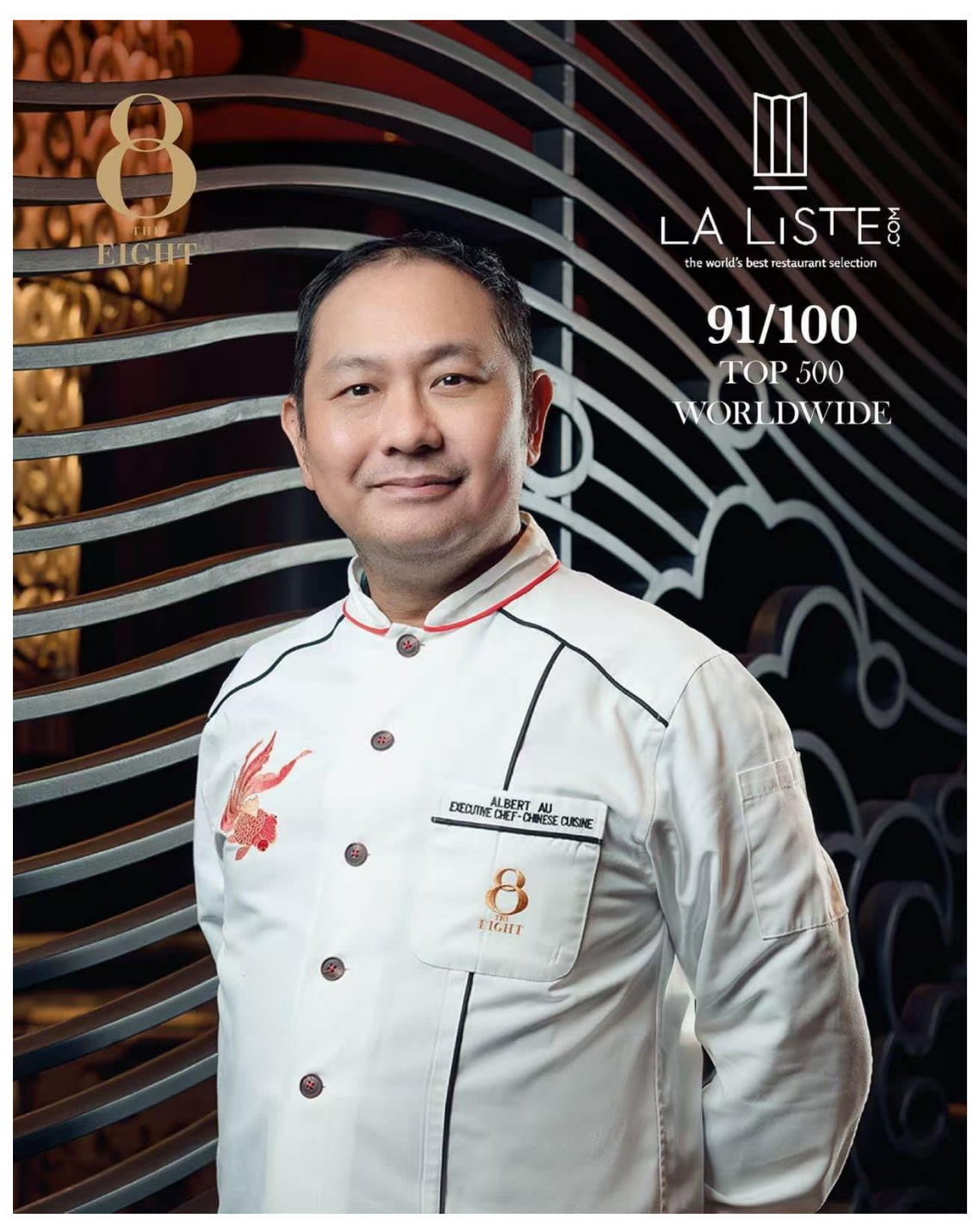
Known for its artistic dim sum and innovative Cantonese delicacies, The 8 seamlessly blends cultural symbolism with modern flair, featuring motifs of goldfish and the auspicious number eight in its elegant and distinctive design.