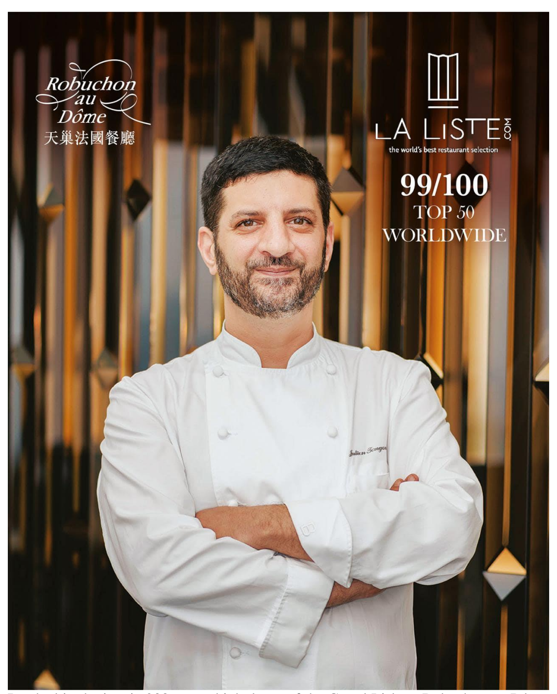
Perched in the iconic 238-metre-high dome of the Grand Lisboa, Robuchon au Dôme is lauded as one of Asia's premier fine dining destinations, offering breathtaking views of Macau paired with exquisite French haute cuisine.