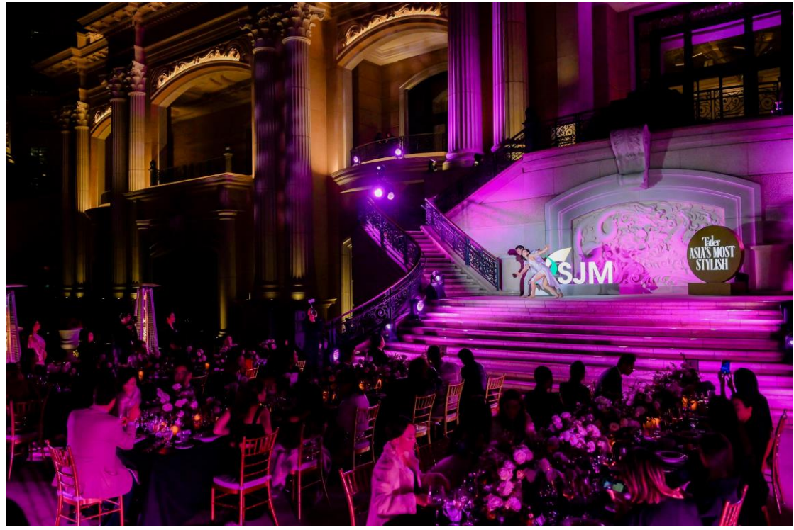
International trendsetters and distinguished trailblazers gathered at Jardim Secreto of Grand Lisboa Palace for an evening celebrating taste and style.