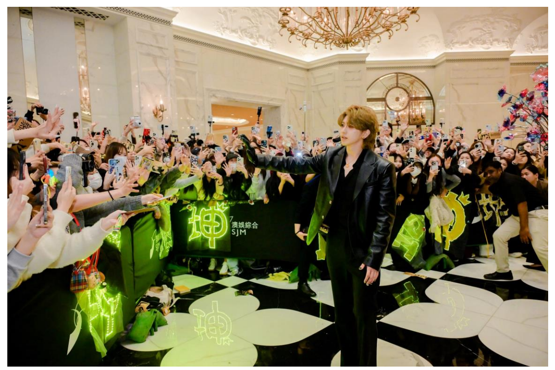
The special appearance of Cai Xukun, acclaimed Chinese singer-songwriter and actor elevated the soiree.