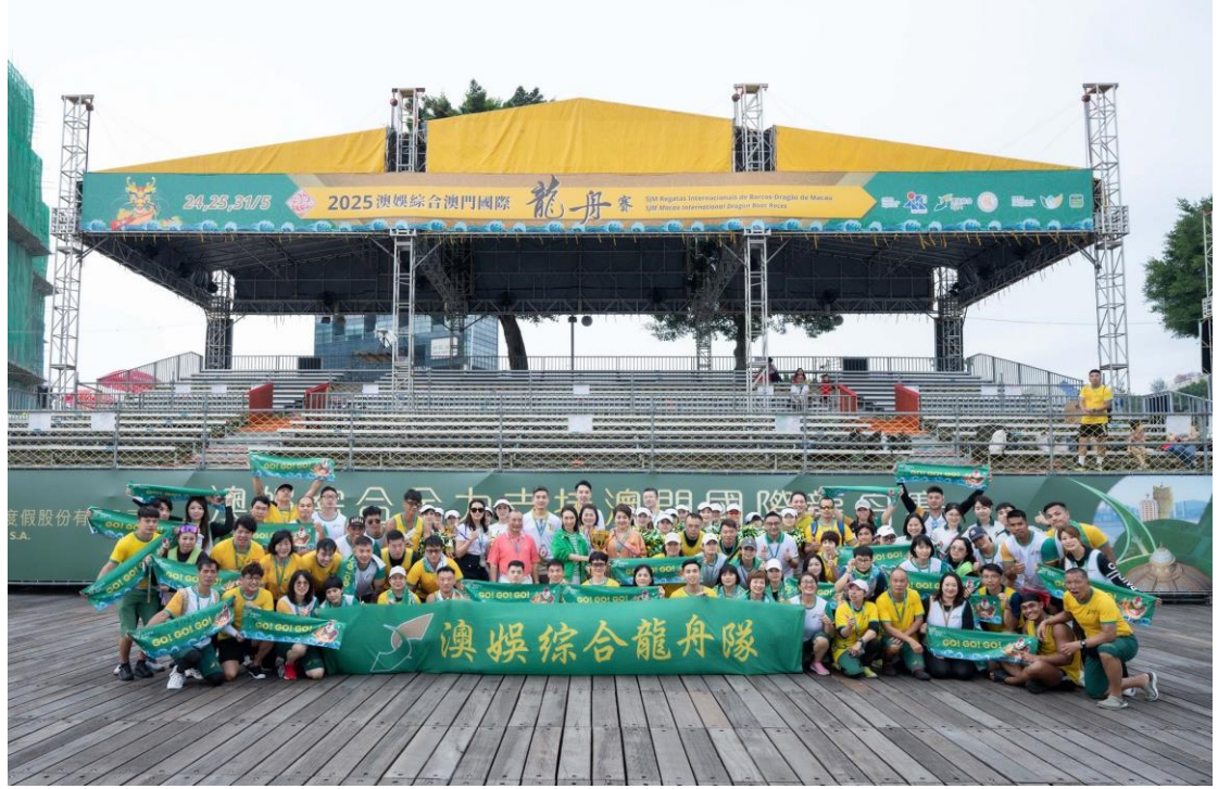
SJM management posed for a photo with the SJM dragon boat teams.