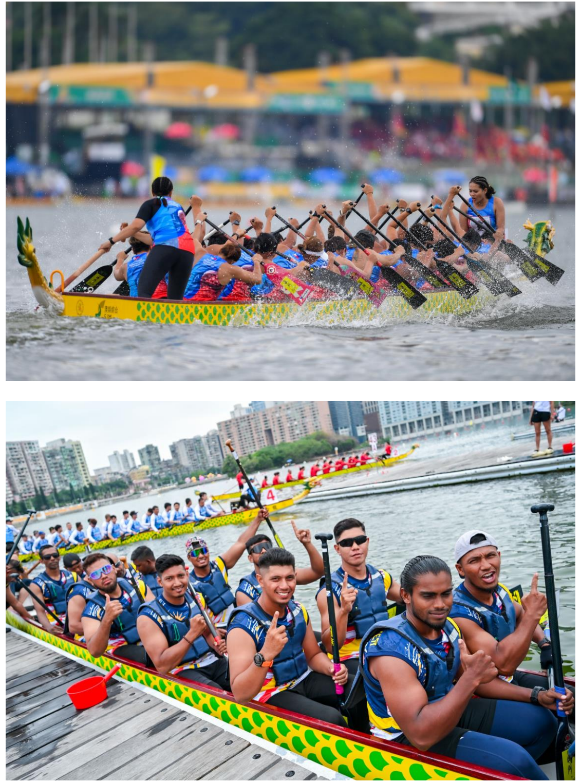
Dragon boat teams from around the world demonstrated remarkable perseverance and team spirit throughout the races.