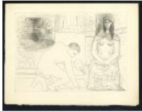
Pablo Picasso, Painter Picking up his Brush, and Model with Turban, 1927-28. © Succession Picasso 2025. © Museo Casa Natal Picasso

Painter Picking up his Brush, and Model with Turban: Inspired by French author Balzac, this copperplate etching reimagine the artist's studio, with blank canvases symbolising boundless creative potential.