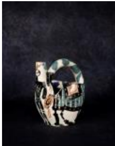
Pablo Picasso, Cavalier and Horse, 1952. © Succession Picasso 2025. © Museo Casa Natal Picasso

Cavalier and Horse: A ceramic breakthrough—this spiraled white earthenware vase challenges perspective, embodying Picasso's philosophy: "Learn the rules like a pro, so you can break them like an artist."