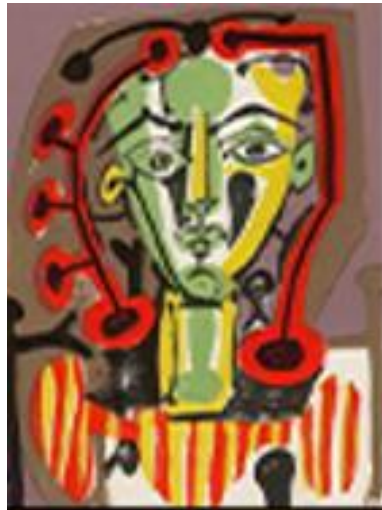
Figure with Striped Bodice: A lithographic masterpiece created for Picasso’s lover Françoise Gilot, employing innovative overlay techniques that redefined printmaking standards.

Pablo Picasso, Figure with the Striped Bodice, 1949. © Succession Picasso 2025. © Museo Casa Natal Picasso