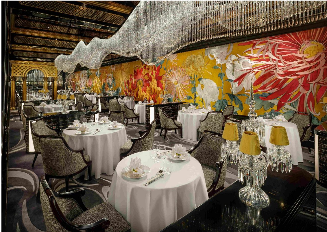
Palace Garden at Grand Lisboa Palace Resort Macau has once again achieved the “Best Award of Excellence.”