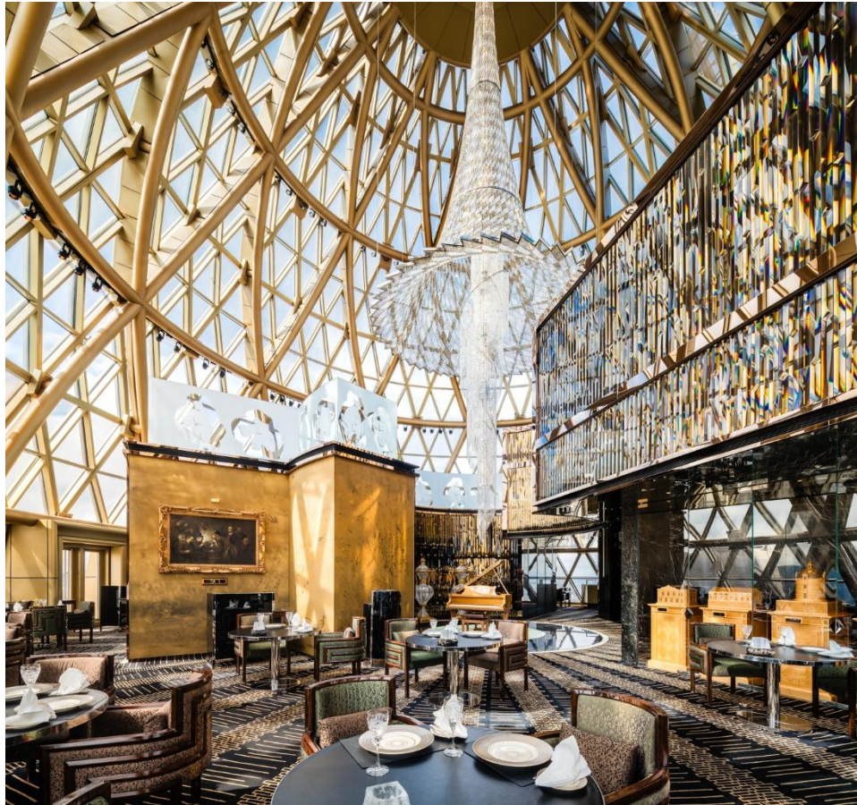
Robuchon au Dôme at Grand Lisboa Macau has been awarded the prestigious Grand Award for the 22nd consecutive years.