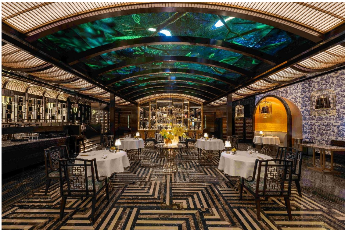
Mesa by José Avillez at Grand Lisboa Palace Resort Macau has once again achieved the “Best Award of Excellence.”