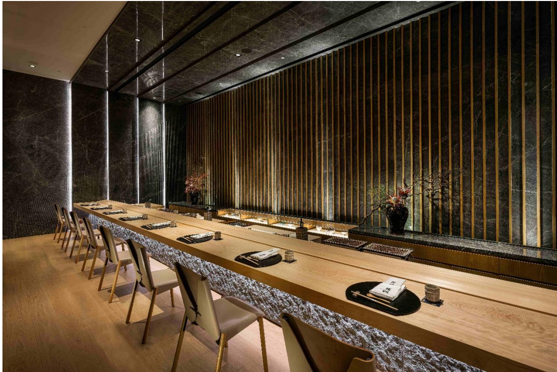
Zuicho at Grand Lisboa Palace Resort Macau has once again achieved the “Best Award of Excellence.”