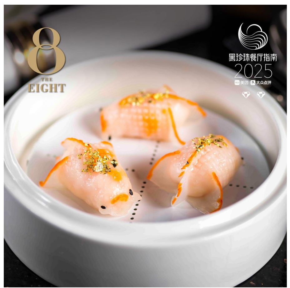
Five restaurants under SJM and its parent company collectively received nine diamonds, the highest number of diamond accolades in the Hong Kong and Macau region.