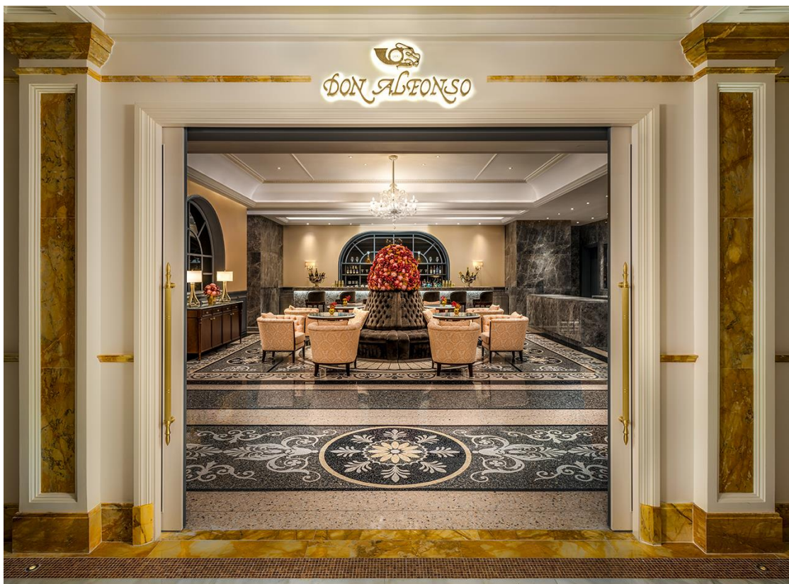
Adorned in opulent Versace style, Don Alfonso 1890 stays true to its MICHELIN-Starred Italian roots, delivering authentic Southern Italian flavours.