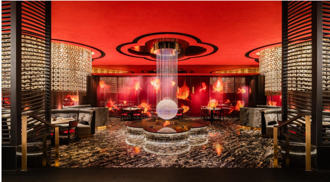
The Eight is celebrated for its refined dim sum and modern Cantonese fare.