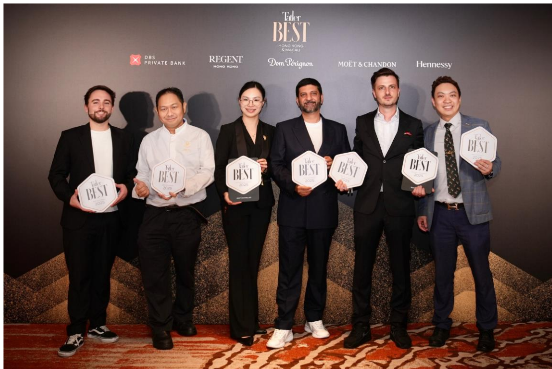
SJM has been honoured with seven awards from Tatler Best Hong Kong and Macau 2025 in recognition of its culinary excellence.