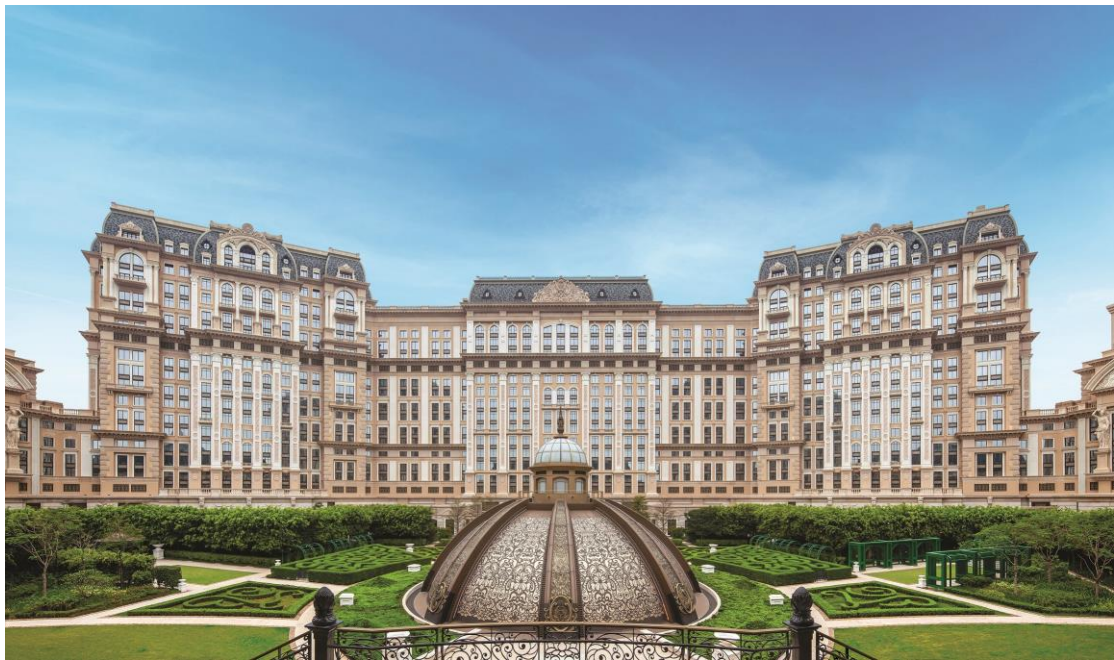
Grand Lisboa Palace blends East and West aesthetics with refined elegance and bespoke service, offering luxurious stays, diverse gourmet experiences, and premier leisure for an unparalleled experience.