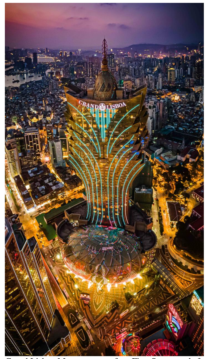
Grand Lisboa Macau secures four Five-Star awards for the sixth consecutive year.